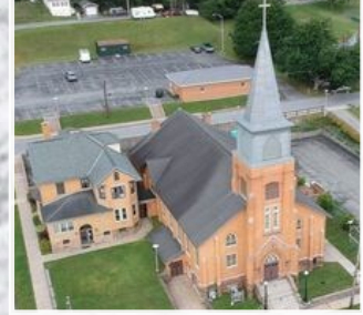
811 Chestnut Avenue N. Cambria, PA 15714