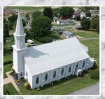
2410 Campbell Avenue N. Cambria, PA 15714